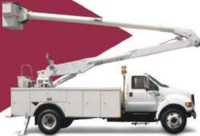
► Utility Specialized Trucks