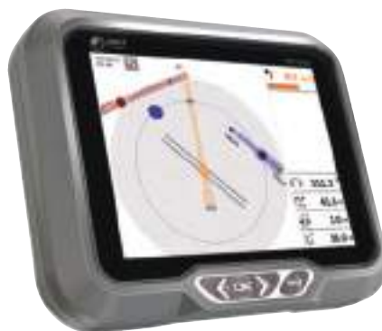
The DCS 60 is apt for all kinds of cranes.

“We have a dedicated team of technicians to ensure the continuous monitoring of client’s project – from installation request to the programming of systems – training and