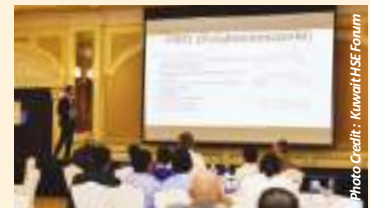
The event will highlight health, safety and security aspects in the region.

The topical agenda will include updates on Civil Defence Authority regulations and comply with the latest international benchmarks such as ISO 45001.