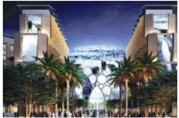
About 70 per cent of visitors are projected to come from outside the UAE – the highest international proportion in the 167-year history of world expos.

"Emaar Hospitality Group will continue to provide an exceptional hospitality experience that wows all of Expo 2020's visitors, including world leaders, encouraging them to return to Dubai and the UAE, creating long-lasting benefits for the entire tourism industry."