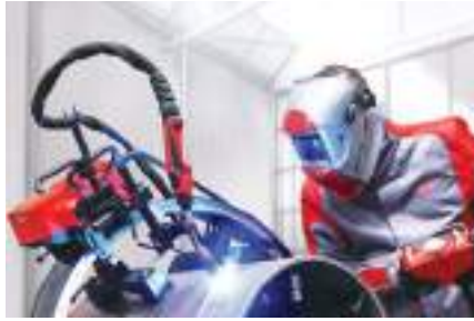
The FlexTrack 45 Pro rail-mounted welding carriage is suitable for use in the construction of containers, power stations, bridges, ships and vehicles.

The FlexTrack 45 Pro rail-mounted welding carriage is a new addition to the range. It is suitable for use in the construction of containers, power stations, bridges, ships and vehicles, and consists of a rail system mounted on the component to be welded plus a carriage that moves on the rails and guides the welding torch. The rails are attached to bridges using a magnet, vacuum