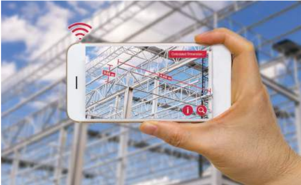
تزداد الفرصة لتحسين الكفاءة مع استخدام الهواتف الذكية أو الحواسيب اللوحية