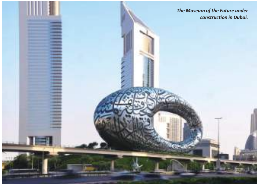
The Museum of the Future under construction in Dubai.