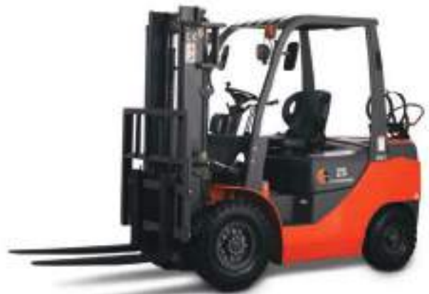
► Forklifts (Diesel - Gasoline LPG - Electrical)