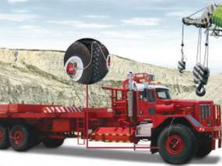
► Central Tire Inflation System (CTIS)