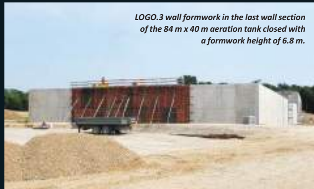
LOGO.3 wall formwork in the last wall section of the 84 m x 40 m aeration tank closed with a formwork height of 6.8 m.

The sewage treatment plant expansion project valued at about US$56.2mn includes an additional aeration tank occupying a construction area of 330 m x 150 m, two final sedimentation tanks with an external diameter of 73 m, for which parts of the footing