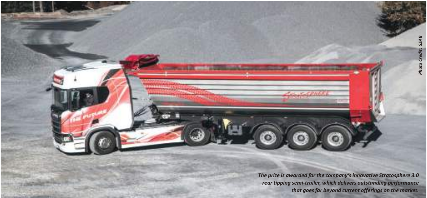
The prize is awarded for the company's innovative Stratosphere 3.0 rear tipping semi-trailer, which delivers outstanding performance that goes far beyond current offerings on the market.

The Italian firm uses SSAB's steel products for its sleek, high-performance, lightweight and durable design vehicles.