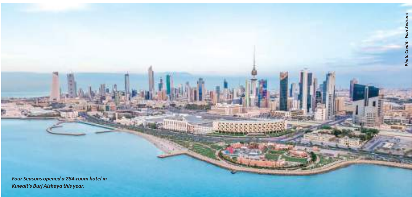
Four Seasons opened a 284-room hotel in Kuwait's Burj Alshaya this year.

Bahrain Economic Development Board (EDB) is working closely with BTEA and