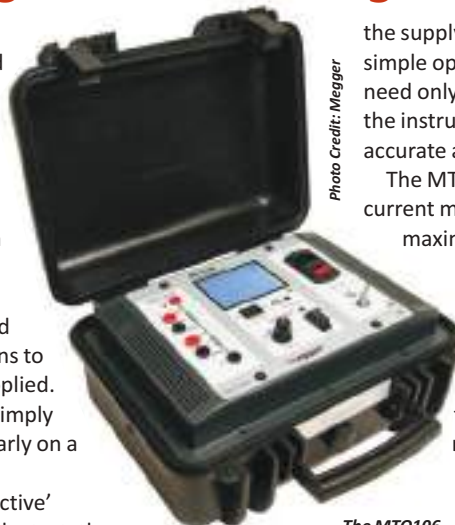
The MTO106 transformer ohmmeter.

To ensure safe operation, audible and visual 'test active' indicators operate during the test and, at the end of the test, the winding is automatically discharged with visual and audible indicators in operation. Discharge continues to completion even if