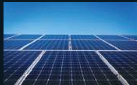
The Mohammed bin Rashid Al Maktoum Solar Park is the largest single-site solar park in the world, with a planned capacity of 1 GW by 2020, and 5 GW by 2030, with a total investment of US$13.61bn.

It will also deliver the project using the specialised CSP technology team based in the Renewable Energy Center of Excellence in Madrid, Spain, with support from Shanghai-based engineers, and will draw on the Dubai