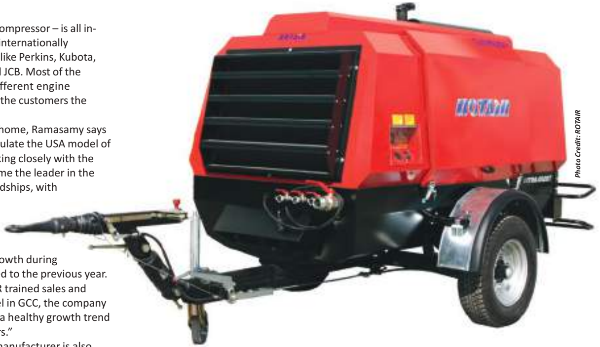
The MDVS line from ROTAIR. These portable compressors are suitable for mining, drilling and O&G operations.

ROTAIR compressors are simple in design yet they are rugged in the job sites. They have been time tested for continuous use even in the hottest summer conditions in