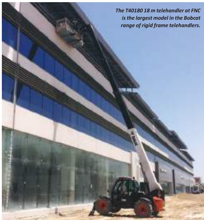
The T40180 18 m telehandler at FNC is the largest model in the Bobcat range of rigid frame telehandlers.

Featuring optimised ROPS/FOPS protection, the cab on the T40180 telehandler offers increased safety and visibility through a curved front window providing a better view of loads and attachments at height; a larger back window increasing sight to the rear and a cab door with windows above and below the handlebar for optimum visibility when manoeuvring the machine. From the comfortable seat, the operator is provided with an ergonomic array of machine controls all within easy reach and including a forward/reverse (FNR) control button on the joystick; a digital display; an adjustable steering wheel and an integrated airflow solution.