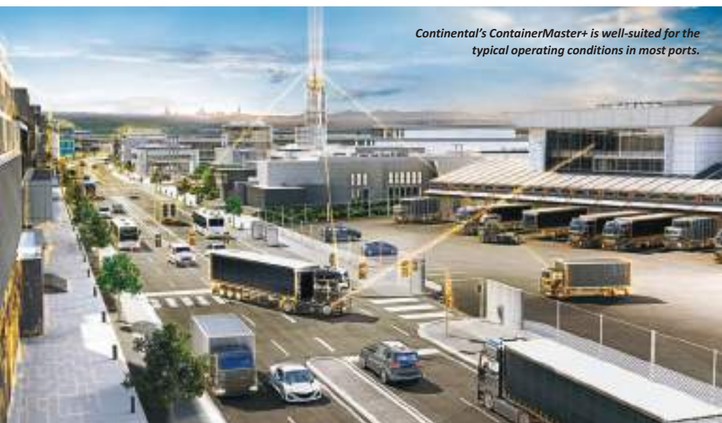
Continental's ContainerMaster+ is well-suited for the typical operating conditions in most ports.

To meet the challenging and highly specialised needs of operators in ports and intermodal operations, Continental Commercial Specialty Tires (CST) offers a complete tyre portfolio for fleets.